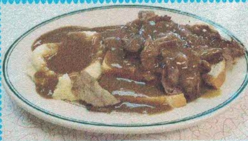
*Hot Beef, Turkey or Meatloaf Sandwich With Mashed Potatoes Smothered in Gravy Half 11.50 Full 14.50