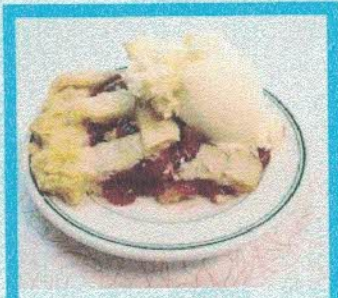
Homemade Pie 5.00 Ala Mode 6.50