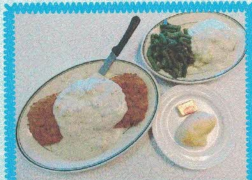
*Chicken Fried Steak 11oz Half 13.00 Full 16.50