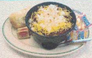
Skyway Chili Available Ask your Server