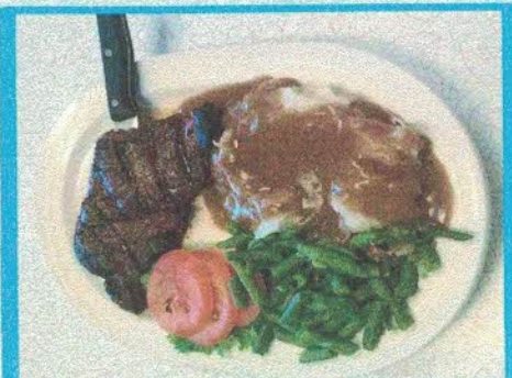
*Steak Lunch 8oz 17.50

*Hamburger Steak Half 10.25 Full 13.00 *Pork Chops (2) 4oz 13.00