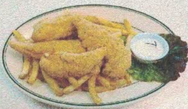
Chicken Strips & Fries Half 11.00 Full 16.00