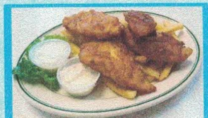
Fish & Chips With a Cup of Soup Half 11.50 Full 16.00

**Menu prices may fluctuate due to Market Prices - $8.00 Minimum Purchase Required for Credit Cards** *Government Warning! Our Steaks & Eggs are cooked to order. Consuming under cooked meats & eggs may increase your risks of food borne illness. Rev 1/1/2021