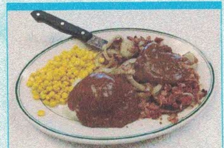
*Liver & Onions Half 11.50 Full 14.00

Weekday Barnstormer Special Monday-Friday Only! Ask your Server Half 10.50 Full 12.50