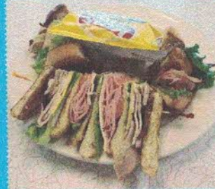
Club House 15.00

ADD Salad to above Sandwiches for only 4.00 ADD Soup to above Sandwiches for only Cup 3.75 Bowl 5.50