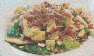
Oriental Chicken Salad 16.00