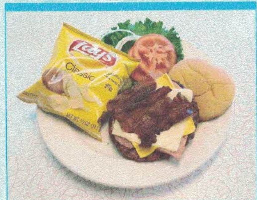
*Burger, Ham, Bacon & Cheese 1/3 lb 13.50