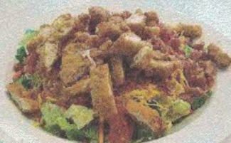
Crispy Chicken Salad 16.00