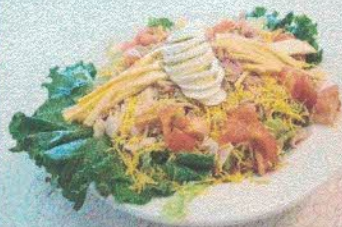
Chef Salad Large 16.00 Small 13.00