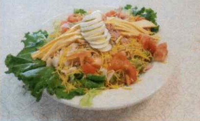
Chef Salad Large 17.85 Small 14.35