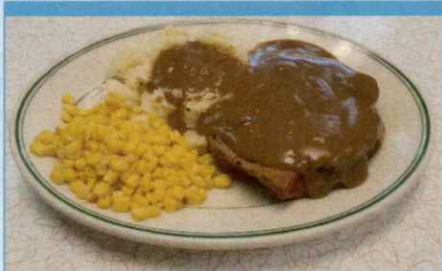
*Meat Loaf Half 11.35 Full 14.85

LUNCHES SERVED WITH CHOICE OF POTATOE, VEGGIE OR TOMATOE SLICES, PLUS DINNER ROLL & DESSERT