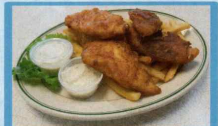
Fish & Chips With a Cup of Soup Half 12.35 Full 17.85

**Menu prices may fluctuate due to Market Prices - $10.00 Minimum Purchase Required for Credit Cards**