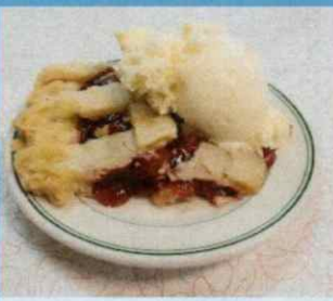
Homemade Pie 5.00 Ala Mode 6.50