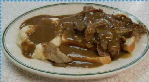
*Hot Beef, Turkey or Meatloaf Sandwich With Mashed Potatoes Smothered in Gravy Half 12.35 Full 15.85