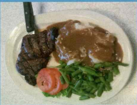
*Steak Lunch 8oz 17.85