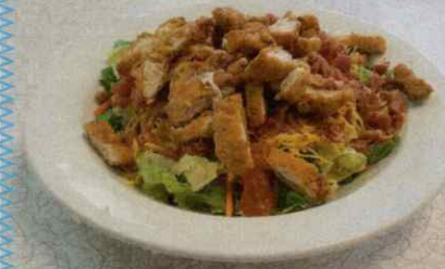
Crispy Chicken Salad 17.85