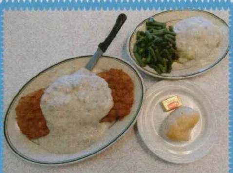
*Chicken Fried Steak 11oz Half 14.85 Full 18.85