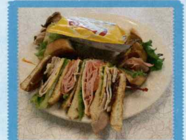
Club House 17.35

ADD Salad to above Sandwiches for only 4.00 ADD Soup to above Sandwiches for only Cup 4.00 Bowl 6.00