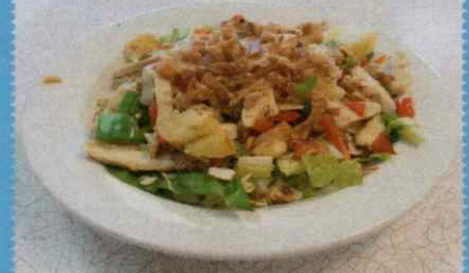
Oriental Chicken Salad 17.85