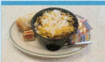
Skyway Chili Available Ask your Server