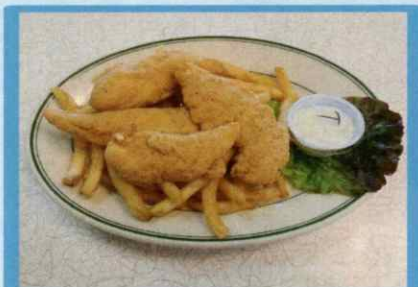
Chicken Strips & Fries Half 12.35 Full 17.85