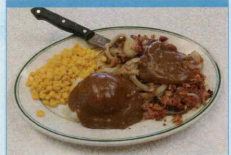
*Liver & Onions Half 12.85 Full 16.35

Weekday Barnstormer Special Monday-Friday Only! Ask your Server Half 12.35 Full 14.85